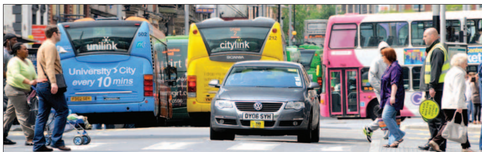
Winning modal shift from cars to buses and coaches is one key area that seminars subjects that will cover

Seminars examine the current hot topics of cost control, ITSO and government policy and regulation