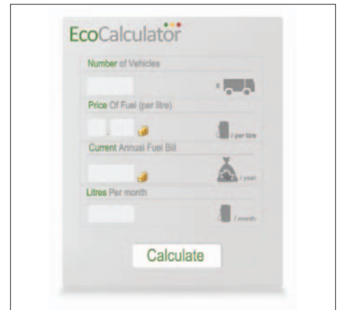
Instant results demonstrate savings

Coach and bus operators are being encouraged to use a revolutionary new website to calculate how much they could save on fuel by installing the award winning fuel saving and safety device EcoManager.