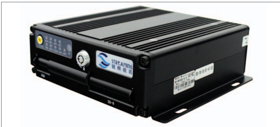
Firm now has more than 20 patents for its designs which are in use around the world

A cost-effective wireless mobile surveillance system with superior quality, and the stability to meet the requirement for transport is the bedrock of Streaming Video Technology (SVT), says the firm.